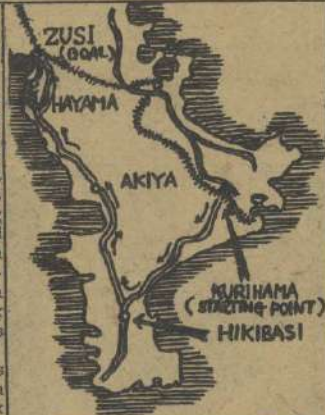
THE COURSE OF THIS YEAR

The race began at 8:22. Knowing from our experience of last year that it is very important to win from the beginning, we hurried along the way